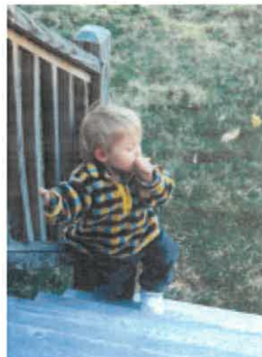
Children touching unsealed treated wood, and then putting their hands in their mouths is the biggest concern.

Too much arsenic can cause cancer. So it is good to prevent arsenic getting into your body when you can. When you touch wood treated with arsenic, you can get arsenic on your hands. The arsenic on your hands can get into your mouth if you are not careful about washing before eating. Young children are most at risk because they are more likely to put their hands in their mouths. The good news is that there are simple things you can do to protect yourself and your family from arsenic treated wood. This fact sheet will tell you how.