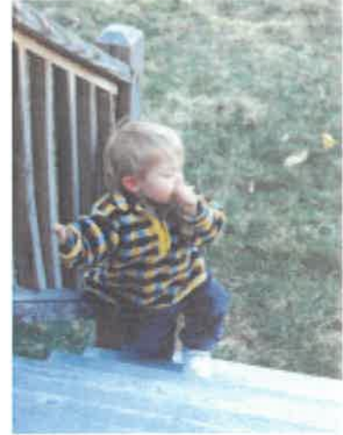
Children touching unsealed treated wood, and then putting their hands in their mouths is the biggest concern.

Too much arsenic can cause cancer. So it is good to prevent arsenic getting into your body when you can. When you touch wood treated with arsenic, you can get arsenic on your hands. The arsenic on your hands can get into your mouth if you are not careful about washing before eating. Young children are most at risk because they are more likely to put their hands in their mouths. The good news is that there are simple things you can do to protect yourself and your family from arsenic treated wood. This fact sheet will tell you how.